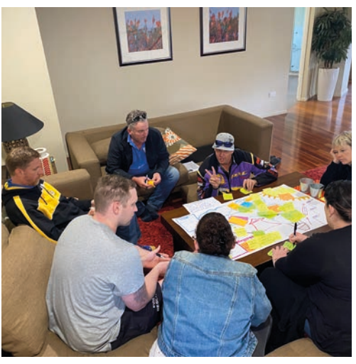
Our Year in Review >>>